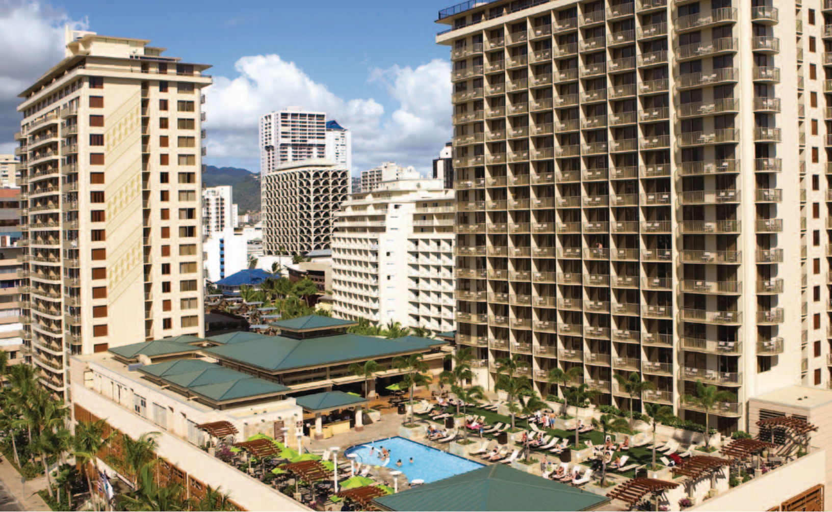
Embassy Suites – Waikiki Beach Walk