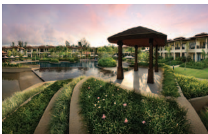
Outrigger Laguna Phuket Resort & Villas