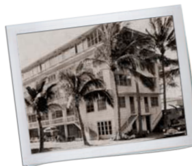
The Islander, built 1947