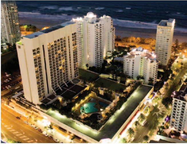
Outrigger Surfers Paradise