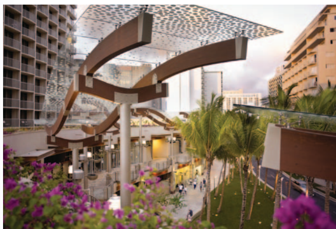
Waikiki Beach Walk®

The new millennium has brought further growth for Outrigger, both in Hawaii and into the expanded Asia-Pacific region. In its continuing efforts to grow and diversify the company, in 2002, Outrigger entered the rapidly expanding timeshare industry by signing a strategic marketing and development alliance with Wyndham Vacation Ownership, the world's largest vacation ownership company and today provides on-site management services at five Wyndham Vacation Ownership properties in Hawaii.