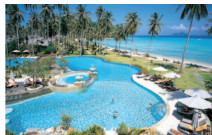
Phi Phi Island Village Beach Resort & Spa