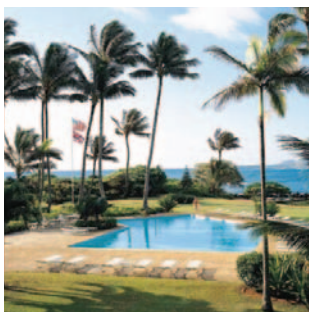
Outrigger at Lae nani