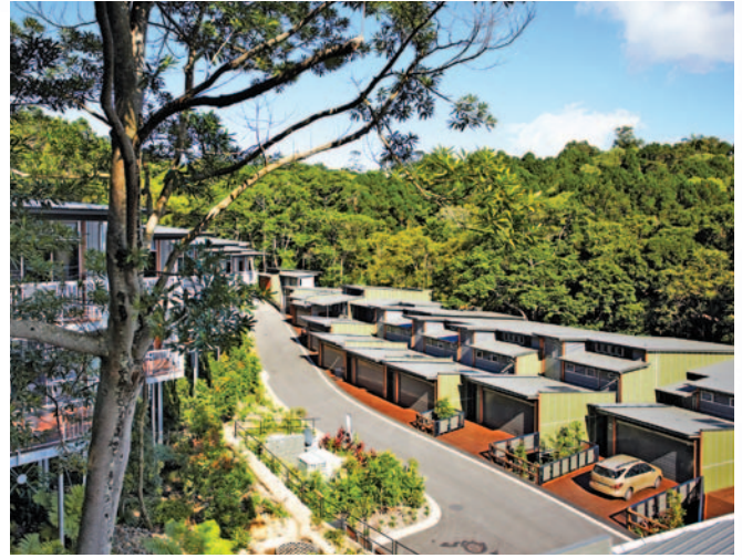
Outrigger Little Hastings Street Resort & Spa, Noosa