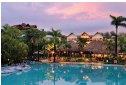
Outrigger on the Lagoon Fiji

In January 2003, before the construction of Waikiki Beach Walk began, Outrigger affiliated two of its neighbor island properties with global giant, Marriott International, to take advantage of its worldwide sales organization and 17 million members of the Marriott Rewards® program. The properties, formerly known as the Outrigger Waikoloa Beach and the Outrigger Wailea Resort, were renamed the Waikoloa Beach Marriott and Wailea Marriott hotels. Several years later, taking advantage of an opportunistic hotel investment market, both properties were sold with proceeds going towards Outrigger’s multi-million dollar Waikiki Beach Walk redevelopment.