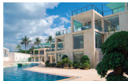
O-CE-N Bali by Outrigger