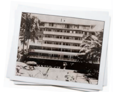
The Edgewater, built 1950