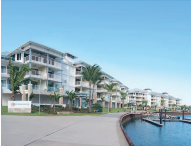
Boathouse Apartments by Outrigger, Airlie Beach