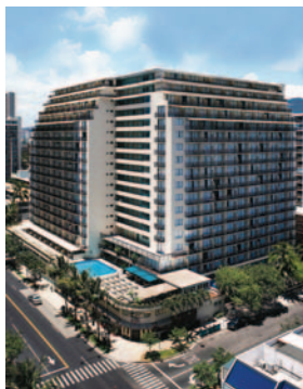
OHANA Waikiki West formerly Outrigger West