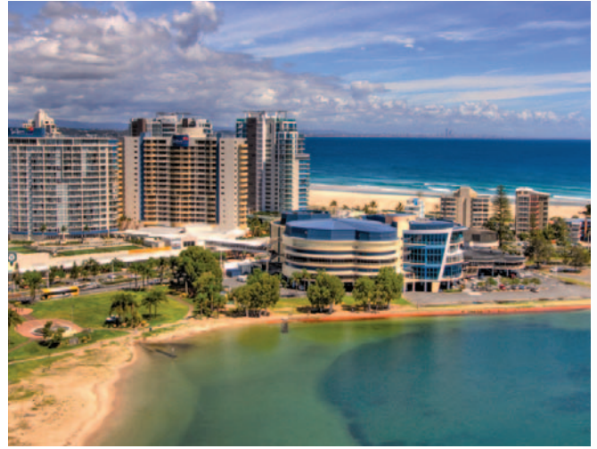
Outrigger Twin Towns Resort, Coolangatta