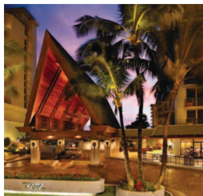
Outrigger Reef on the Beach

In January 2009, Outrigger Reef on the Beach finished a $110 million transformation that is now the landmark anchor to Waikiki Beach Walk. The new Outrigger Reef is a stunning new oceanfront haven of elegance, comfort, gracious hospitality, and unparalleled commitment to Hawaiian culture. As one of the state's foremost supporters of Hawaiian culture, Outrigger Reef on the Beach highlights the remarkable achievements of Hawaii's courageous ocean voyagers and honors the deep relationship between Hawaii's people and the sea. The hotel's stunning cultural assets were honored by the Hawaii Tourism Authority's prestigious Keep It Hawaii Award.