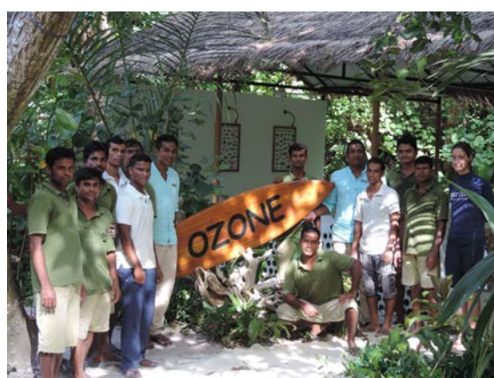
The sustainable OZONE Hut – made for presentations and talks on marine life at the Outrigger (download images here )

Outrigger Resorts has a global marine conservation programme called OZONE (Outrigger's zone). Inspired by the initiative, staff at the Outrigger Konotta Maldives Resort have created The OZONE Hut, an educational workspace to organise environmental campaigns and give presentations about the importance of preserving the underwater habitat of the Indian Ocean.