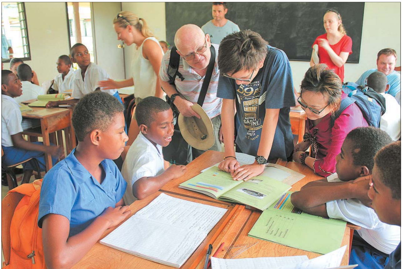
UP CLOSE: Outrigger guests meet students and swap stories.