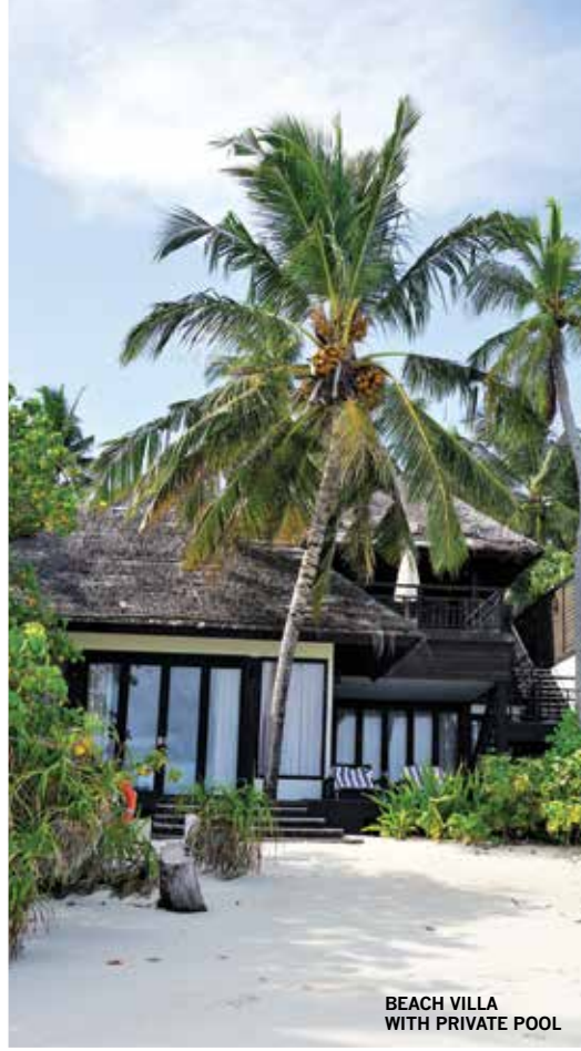
BEACH VILLA WITH PRIVATE POOL

We were lucky that we were there when the moon was full, and it would make an entrance as we were enjoying dinner. At the Outrigger we enjoyed many special moments. And sometimes those moments were with the staff. Their warmth went beyond hospitality, it is personality. Everyone was engaging, and we always felt as if we were being given special treatment – which everyone else received.