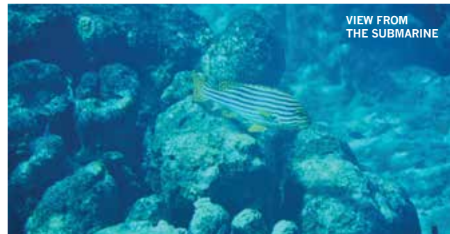
VIEW FROM THE SUBMARINE