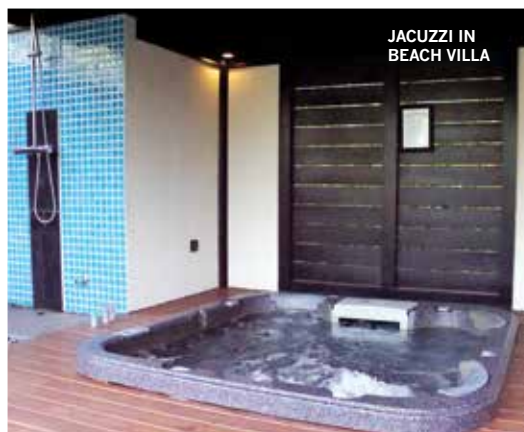
JACUZZI IN BEACH VILLA