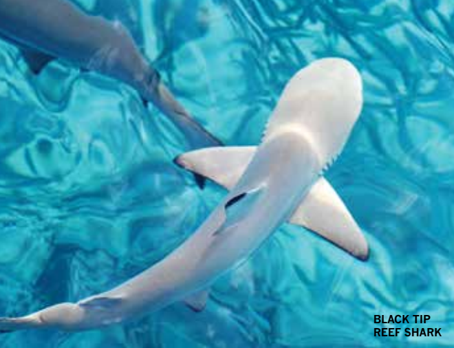
BLACK TIP REEF SHARK

The living and sleeping rooms are decadently spacious, not only allowing your body to stretch out, but your inner being to expand. The bathrooms are oversized, and numerous relaxation areas that include outdoor lounges, sun decks, the hot tub area and the private swimming pool with an always trickling wall fountain ensure you are completely comfortable in your piece of paradise. Amenities include rain showers, bathtubs, carefully stocked minibars. The two-bedroom beach pool villas have private kitchens with state-of-the-art equipment.