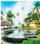
The Outrigger is the perfect location for lovebirds

If escaping to a lush, romantic paradise sounds like your thing, Koh Samui is for you. The Outrigger Koh Samui Beach Resort is all about romance, but while it's definitely popular with honeymooners (and a proposal hotspot!), you'll likely see a few families, too. Seclude yourself in one of the resort's 52 stunning suites, which each come with a private sundeck and cooling plunge pool! Set against the gorgeous shores of Hanuman Bay near Chaweng Beach, you can dine under the stars to the soothing sound of the ocean. After a massage at the serene Navasana Spa, relax at the resort or book a tour of island exploring and adventures, such as sunset sailing, diving and snorkelling, or a jungle safari!