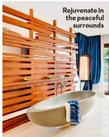
Rejuvenate in the peaceful surrounds