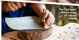
The Outrigger offers a range of cultural classes