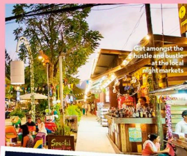
Get amongst the hustle and bustle at the local night markets

Head on down to Fisherman's Village in Bophut, where you can explore the bustling night markets in Walking Street. Find a range of unique foods, clothes, handicrafts and street performances including Muay Thai demos, music and beatboxing, and traditional Thai dances. Then chill out at Coco Tam's, where you can watch a fire show while enjoying the club's famous 'Dark Passion' cocktail.