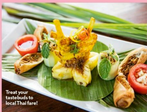
Treat your taste buds to local Thai fare!

Set against the backdrop of the pristine ocean, Outrigger's Edgewater restaurant offers an array of sumptuous local and international delicacies, and is well-known on the island for its wood-fired pizza. Then relax at the resort's pool bar, or head to Sunset by Angelina in nearby Bophut to kick back with a meal or cocktail as you watch the stunning sunset.