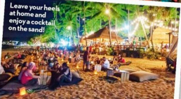
Leave your heels at home and enjoy a cocktail on the sand!