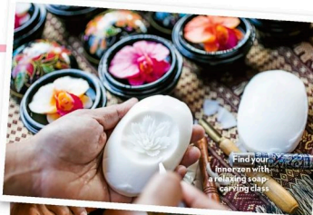
Find your inner zen with this soap-carving class

Those who prefer to stay closer to home base can take advantage of one of the many classes on offer at Outrigger. Take part in a soap or leather-carving class, where you'll learn a cultural skill taught by a traditional master. If cooking is your thing, join a class at the Blue Fire Thai Cooking School, where you'll discover how to whip up authentic dishes like tom yum goong. You can also get in touch with your inner yogi with a relaxing yoga session by the beach or garden.