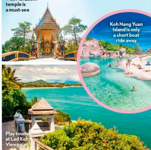
Koh Nang Yuan Island is only a short boat ride away