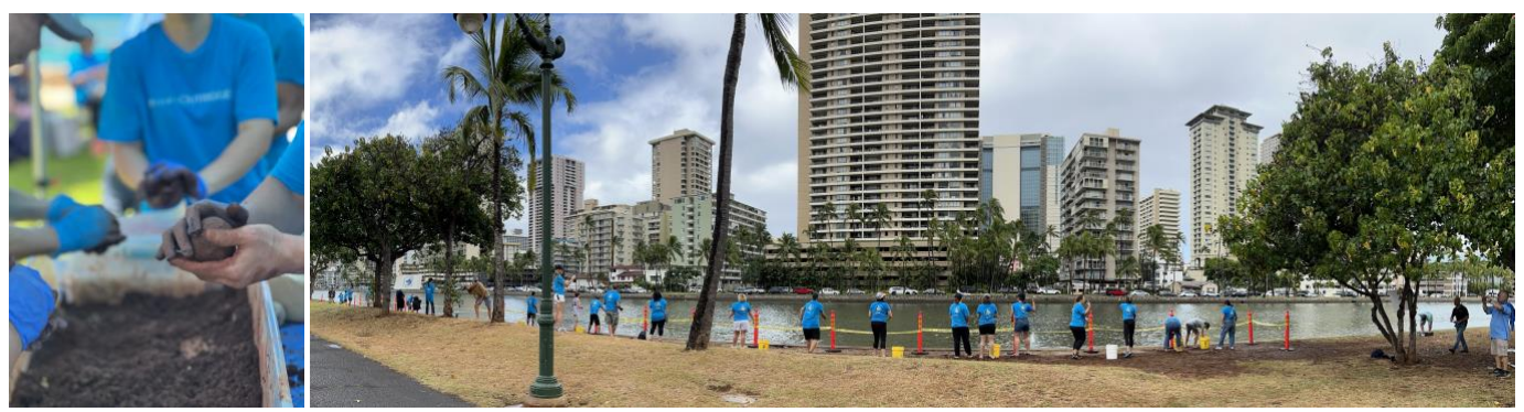
Genki Ball-making in process at OUTRIGGER Zone Day at Waikīkī Aquarium (photo left) and the toss by OUTRIGGER hosts at Ala Wai Canal (photo right)

HONOLULU – Closing out its global World Ocean Month endeavors, <u>OUTRIGGER Resorts & Hotels</u> invited the public to join them at the Ala Wai Community Garden on Saturday, July 15, at 9 a.m. to toss more than 5,000 mud "Genki Balls" into the Ala Wai Canal – a key waterway to the Pacific Ocean.