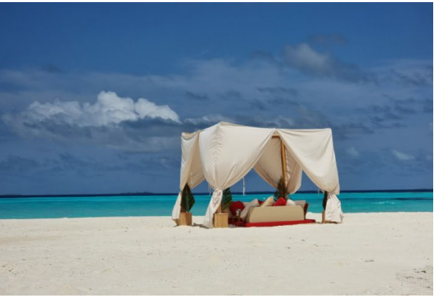
Barefoot luxury exemplified: Lonubo, a private island that guests can have to themselves, adjacent to OUTRIGGER Maldives Maafushivaru Resort [Download images and this press release in Word version <u>here</u>]

THE MALDIVES – OUTRIGGER Maldives Maafushivaru Resort is pleased to unveil an unparalleled experience in barefoot luxury travel, allowing its esteemed guests to bask in the epitome of relaxation on their own secluded haven – the exquisite Lonubo private island.