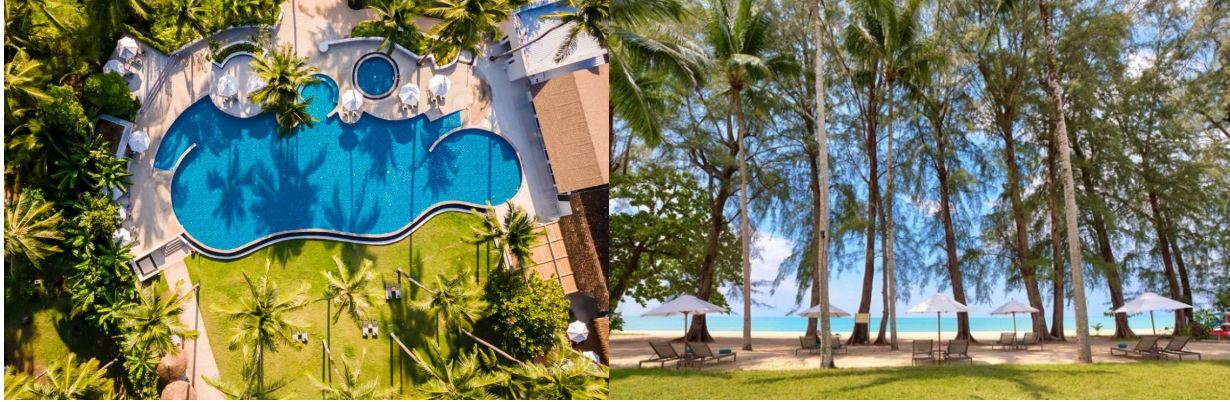
OUTRIGGER Khao Lak Beach Resort

OUTRIGGER Khao Lak Beach Resort , the blissful beachfront retreat with extensive facilities for all ages, is also a haven for sea turtle conservation. The resort's team has helped local organisations to construct a protective enclosure where the turtles' eggs can hatch without risk of predation. Associates and guests then took part in a major sea turtle releasing initiative. Mangrove reforestation and beach cleaning campaigns have also helped to reinforce Khao Lak's vibrant coastal ecosystem.