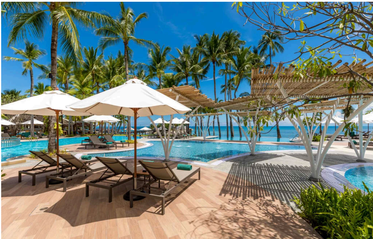
OUTRIGGER Koh Samui Beach Resort

This important, independent eco-rating for OUTRIGGER Surin Beach Resort, OUTRIGGER Khao Lak Beach Resort and OUTRIGGER Koh Samui Beach Resort reflects the group's deep commitment to sustainable operations