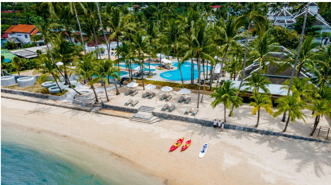
OUTRIGGER Koh Samui Beach Resort

OUTRIGGER Khao Lak Beach Resort , the blissful beachfront retreat with extensive facilities for all ages, is also a haven for sea turtle conservation. The resort's team has helped local organisations to construct a protective enclosure where the turtles' eggs can hatch without risk of predation. Associates and guests then took part in a major sea turtle releasing initiative. Mangrove reforestation and beach cleaning campaigns have also helped to reinforce Khao Lak's vibrant coastal ecosystem.